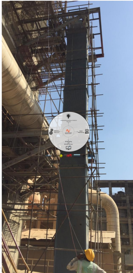
Erection at plant location